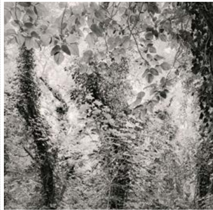
TOP Rock Detail, Point Lobos, 1998 ABOVE Trees, Hoyt Farm Park, Hauppauge, NY, 2003