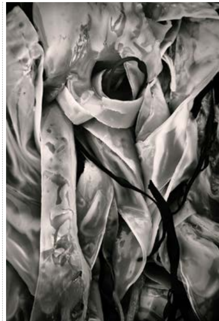
ABOVE Seaweed 254, Seawall, Maine, 2011 BELOW Pond Foam, Somesville, Maine, 2000

I would give myself a lecture on the two modes of thinking required to make a successful photograph. The first is wilful thinking, which is responsible for decision making and focusing our attention on the project in hand. The second is automatic thinking, which is unaffected by will and allows us to recognise an expressive composition. To make a picture these modes must collaborate in a kind of dance – the trick is to keep them from stepping on each other's toes!